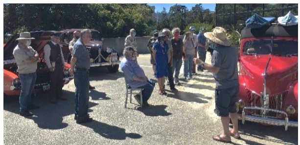
Gigi's Lunch 2020