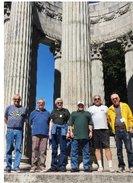
Pulgas Water Temple 2018